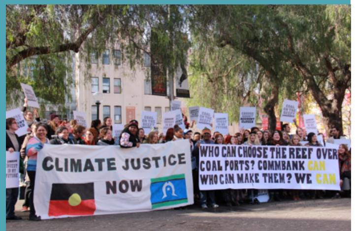
AYCC leaders and volunteers

GWF has also funded important public awareness and action around Fight for The Reef campaign. This campaign has included Great Barrier Reef reporting to UNESCO World Heritage committee, advocating against mining expansions in Qld and community engagement and education.