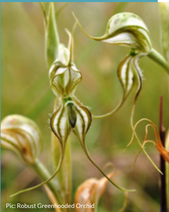
Pic: Robust Greenhooded Orchid

Before Garry passed away in September 2008, he specified Bush Heritage as a conservation group he wished to support. Between 2009 and 2013, $105,000 was gifted to Bush Heritage with a great success being the re-discovery of a species. The Nardoo Hills Reserve in north-central Victoria received funding for management and weed control. After six months of this program roll out, the long presumed to be extinct Robust Greenhood Orchid was discovered on the reserve (last sighted in Maldon in 1941) . 6 plants in total were discovered and now the DSE and Royal Botanical Gardens are researching the orchid to help manage the species and safeguard its future.