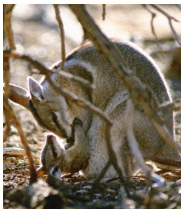
Pic: Bridled Naitail Wallaby and Joey

AWC has also received support from GWF for their Tableland project. In partnership with the Yulmbu Community, AWC manages a vast 308,000 hectare sanctuary in remote central Kimberley. The Yulmbu partnership provides a new model for integrating conservation and community development on indigenous land. AWC leases the land from the community and collaboratively works together to meet specific conservation performance targets. The community receives income, employment, assistance with managing cattle herds and improved infrastructure. Over 40 mammals and 207 birds are found on the sanctuary, with 17 listed as threatened.